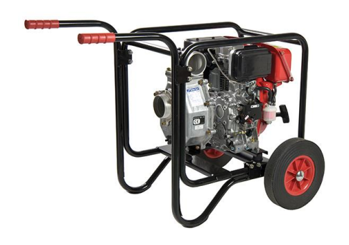
TE4-80RD with trolley