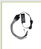
Six-Unit Switching Power PS7002