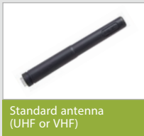
Standard antenna (UHF or VHF)