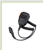
Remote Speaker Microphone (IP57) SM18N2