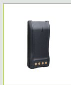
2500mAh Li-Ion Battery BL2503