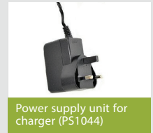
Power supply unit for charger (PS1044)