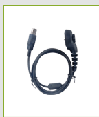
Programming Cable (USB Port) PC38