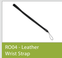
RO04 - Leather Wrist Strap