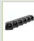
MCU Multi-unit Charger (for Thick Battery) MCA08