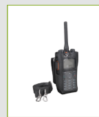
Carrying Case (for thick battery) (leather) (swivel) LCY003