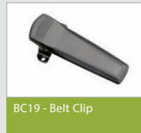
BC19 - Belt Clip