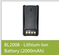
BL2008 - Lithium-Ion Battery (2000mAh)