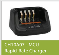
CH10A07 - MCU Rapid-Rate Charger